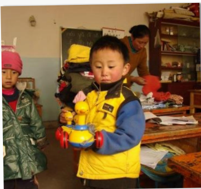
THESE CHILDREN RECEIVED TOYS AND CLOTHES