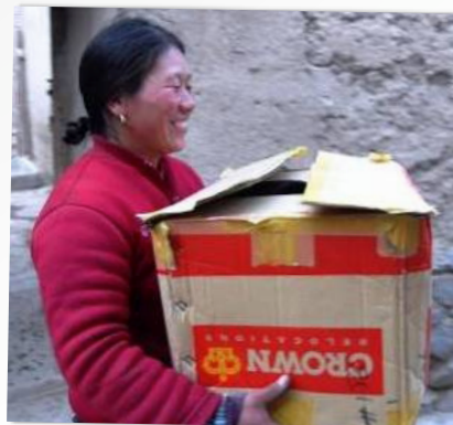
DISTRIBUTION IN CHUSANG VILLAGE